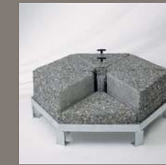
580 kg shade base (12 concrete slabs), welded support tube