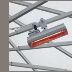
radiant heater grey (max. 4 units for each sunshade)