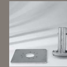
Mounting plate M16, tip-over hinge M16