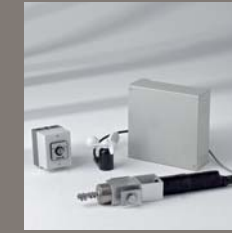
Switch box, motor drive, key switch, anemometer