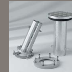
Ground socket M16, tip-over hinge M16