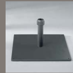
40 kg metal base