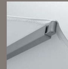
Flexible rod end