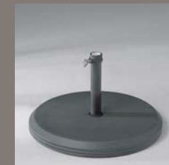
40 kg synthetic-coated anthracite concrete base