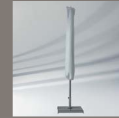
Protective cover with zip and rod