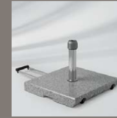
55 kg natural granite base with castors