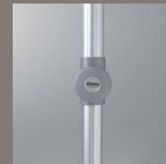
Alu-Push, knob for height adjustment

Advertising imprint: Individual imprints are possible for the Alu-Twist and Alu-Push.