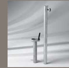
Ground socket with support tube