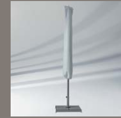
Protective cover with zip and rod