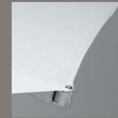
Flexible rod end