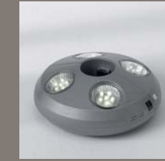
Osyrion accu light