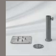
Mounting plate M4, adapter disc M2, support tube