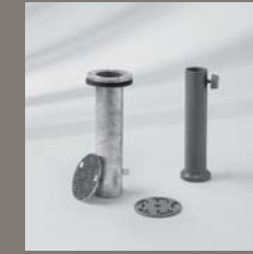
Ground socket M4, adapter disc M2, support tube