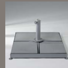
Shade base M2 (8 slabs), support tube